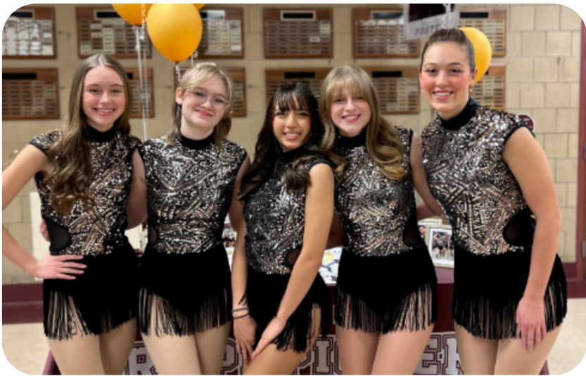
Congratulations to our Senior Dance Team members!