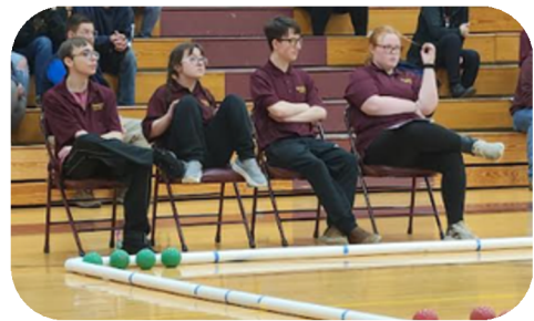
North East Bocce Team show off their skills!